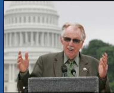
Rep. Roscoe Bartlett (MD) Rep. Charlie Dent (PA)